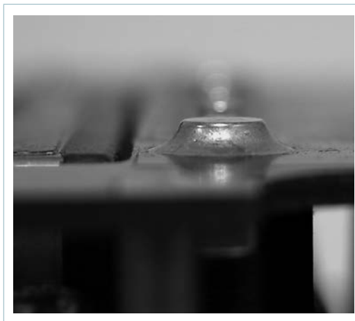
Figure 3 (right)

Side profile of a Mini module solder joint