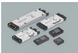
MIL-COTS DCM™ DC-DC converter