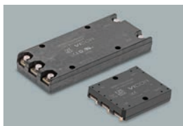
MIL-COTS MFM™ filter