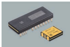
NBM™ bus converter