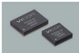
ZVS buck regulator