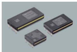
DCM DC-DC converters