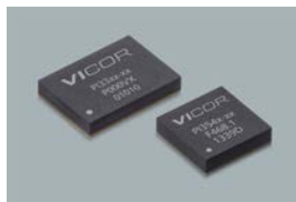
ZVS buck regulators

Inputs: 12V (8 – 18V), 24V (8 – 42V), 48V (30 – 60V)