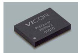
ZVS buck-boost regulators