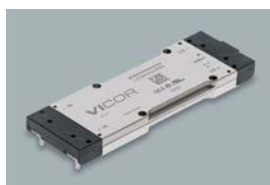
BCM4414 bus converter